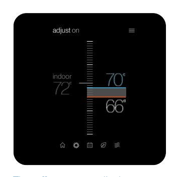
The adjust screen displays the current temperature on the left and set-points on the right. Change the set-points by dragging them or by turning the dial.