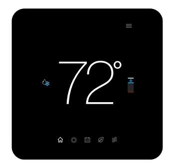
The home screen displays the current temperature, the current system mode, and icons leading to each of the top level screens.